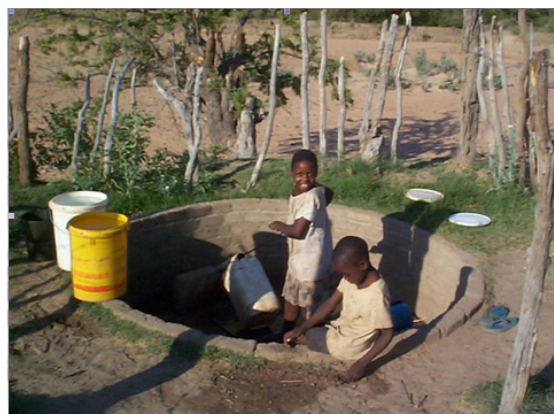
Hand pump to access water from an alluvial aquifer. These are very easy to use, as shown by the children. This pump is at a Dabane Trust supported garden at Tshelanyemba.