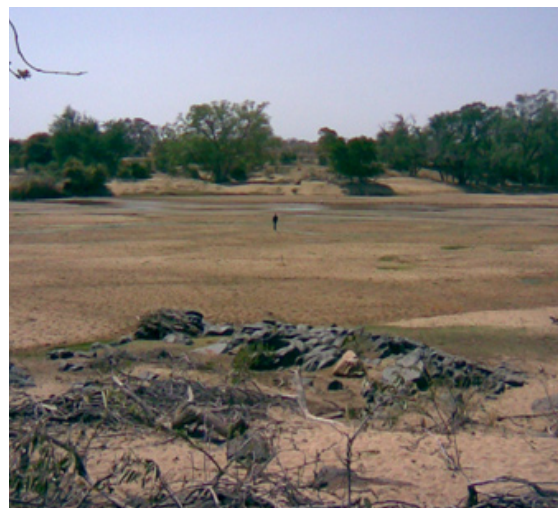
Dolerite dyke crossing the Mzingwane River: The higher competence (resistance to erosion) of the dolerite compared to the country rock leads to deep erosion on each side of the dyke and thus deeper sands to host the aquifer.