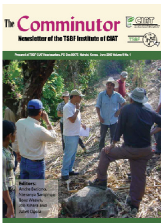
The first visit of Nicaraguan farmers to Honduras was documented in "The Comminutor".

with farmers to develop a production system more suitable for that eco-region. The system is known as "Quesungual", and is locally recognized as a suitable alternative to the SB traditional system (Wélchez and Cherrett, 2002).