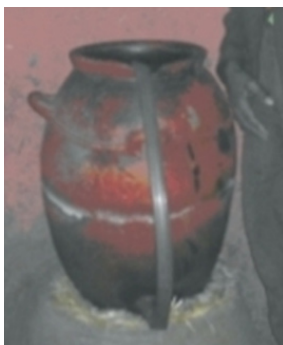
Illustration 1: An example of the filtration pot tested in 40 households in Yubdo-Legebatu peasant association near Ginchi, Ethiopia

One of the health issues in multiple use of water services is the provision of good quality water for drinking (Boelee et al. 2007). Even if the system is intended for domestic purposes, water at the point of use is often polluted during transport and storage (Scheelbeek 2005). Irrigation systems and surface water sources are usually not suitable for drinking but in many cases people have no alternative but to use it (Jeths 2006). In recent years point-of-use home water treatment has been promoted as a way of ensuring safe water consumption at the point where it is used. This is especially relevant for multiple use water services because then a relatively low water quality can be delivered via the central system and only the amount of water used for consumption has to be treated. Available technologies include various combinations of water storage and treatment at a wide range of cost.