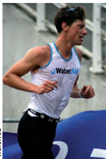
Participant in a triathlon raising money for WaterAid

Besides fundraising, WaterAid's individual supporters also take part in campaigning activities. Communication and feedback to donors is generally via a twice-yearly magazine (Oasis) and a twice-monthly e-newsletter. Water companies and other organisations have regular features in their own magazines and staff communications on what their own employees, customers, companies and local groups are doing for WaterAid.