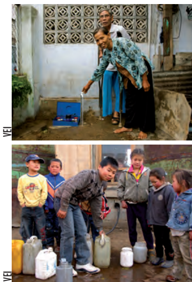
The number of people equipped by VEI in Mozambique, Yemen, Vietnam and Mongolia is estimated at approximately 500 000 inhabitants to date.

Currently 15 000 households, representing 50 000 people, as well as corporate clients participate in Vitens and Evides actions and the number is rising each year.