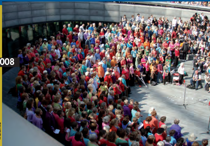
"Sing for Water", another fundraising event