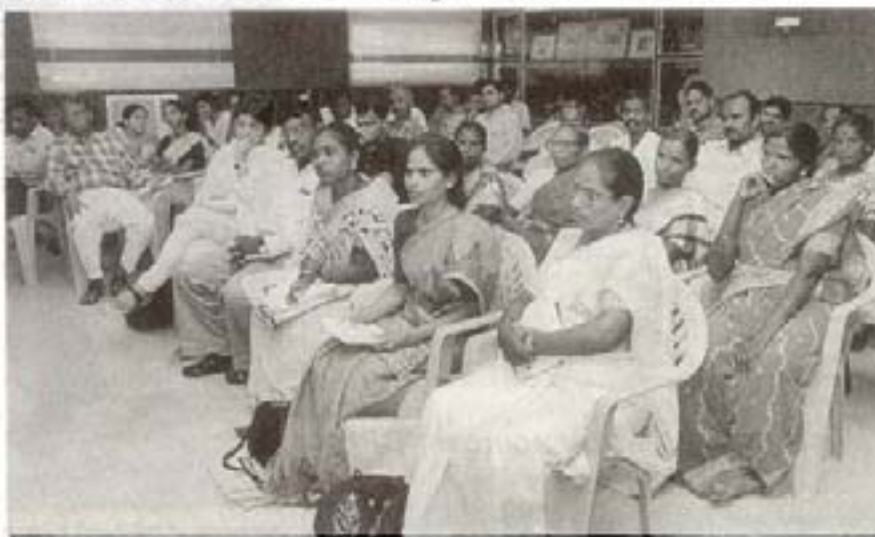
Participants at a workshop on "Facilitating negotiations over water conflicts in peri-urban areas" held in the city.

The workshop on "Facilitating negotiations over water conflicts in peri-urban areas" was based on preliminary observations of a study carried out by MIDS and the Natural Resources Institute, United Kingdom. The three-month study, which concluded a few weeks