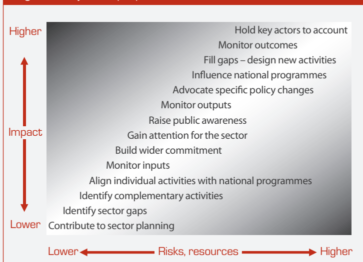
Figure 1 - Dynamic purposes of WASH Coalitions

The purpose may be straightforward or more ambitious. An example of the former might be building a coalition for the purpose of information exchange, to fill knowledge gaps and to facilitate participation in sector planning. These activities are relatively low risk; participation in such a forum carries neither high